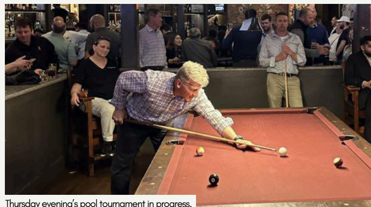
Thursday evening's pool tournament in progress.

An unofficial pool tournament quickly ensued as attendees vied for the top spot at the table. It proved to be a great night filled with lively conversation, craft beer, and fun, light-hearted competition.