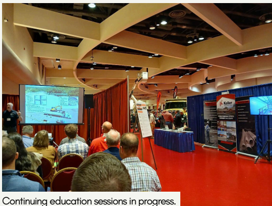
Continuing education sessions in progress.

Thank you to all of our speakers for lecturing!