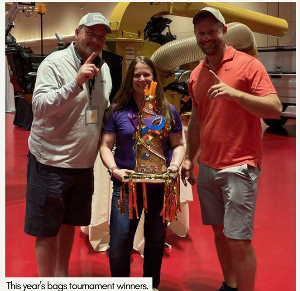
This year's bags tournament winners.

Competition was heated across the exhibit floor as players competed for 1st place bragging rights. Our winners received the Championship Cone Award.