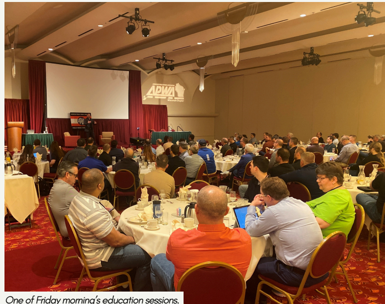
One of Friday morning's education sessions.

Thank you to everyone who took time out of their busy schedules to attend and participate in the events!