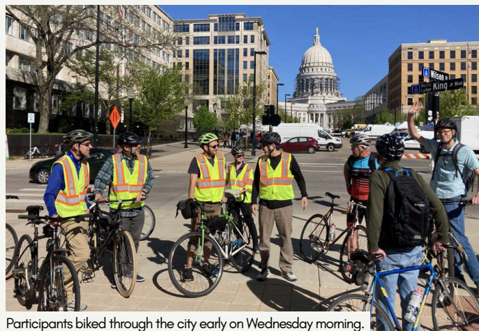
Participants biked through the city early on Wednesday morning.

The very first event of this year's spring conference was a bike tour hosted by the City of Madison. Cyclists enjoyed beautiful weather in the bustling city as they learned about green infrastructure and other public works projects focused on pedestrian and bike transportation.